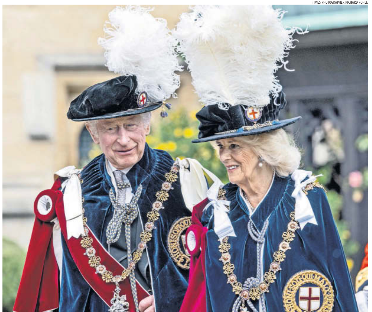
Soft power The King and Queen arriving in velvet for the Order of the Garter service at St George's Chapel, Windsor. Page 11

It dived, then the pings stopped, page 5